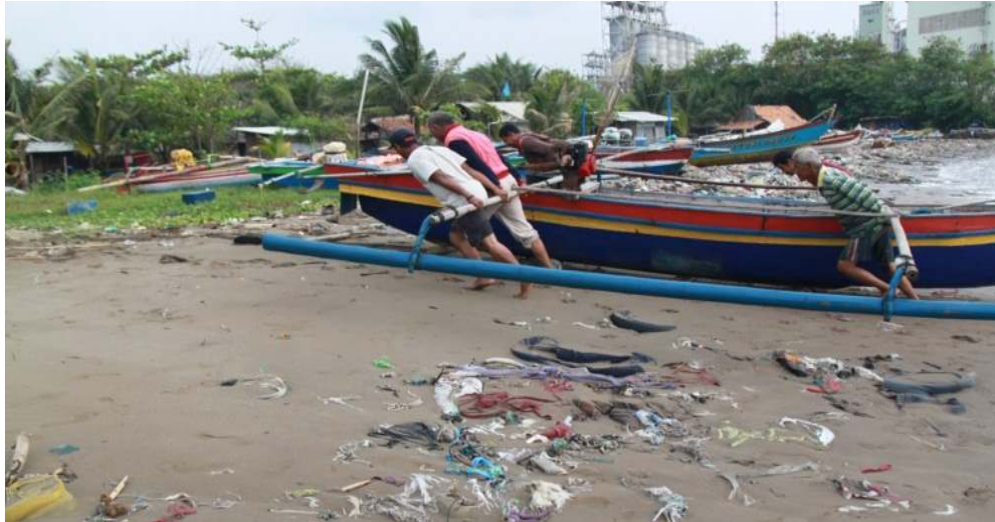
Figure 2. Beach Condition of Target Audience