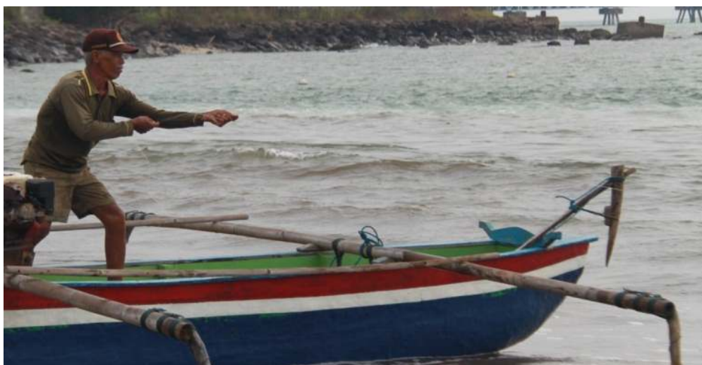
Figure 3. Fishing Activities When Drawing Fishing Rope

From the results of discussions with the fishermen in finding there are some fishermen who have a broken finger caused by not using gloves when pulling the line, so that their fingers Tetanus and broke up. Apart from the absence of gloves this is also due to the ropes of the nets they use are dirty and rusty. Also at the time of the devotion fishermen go fishing do not use black glasses to secure the eyes of fishermen from direct sunlight.