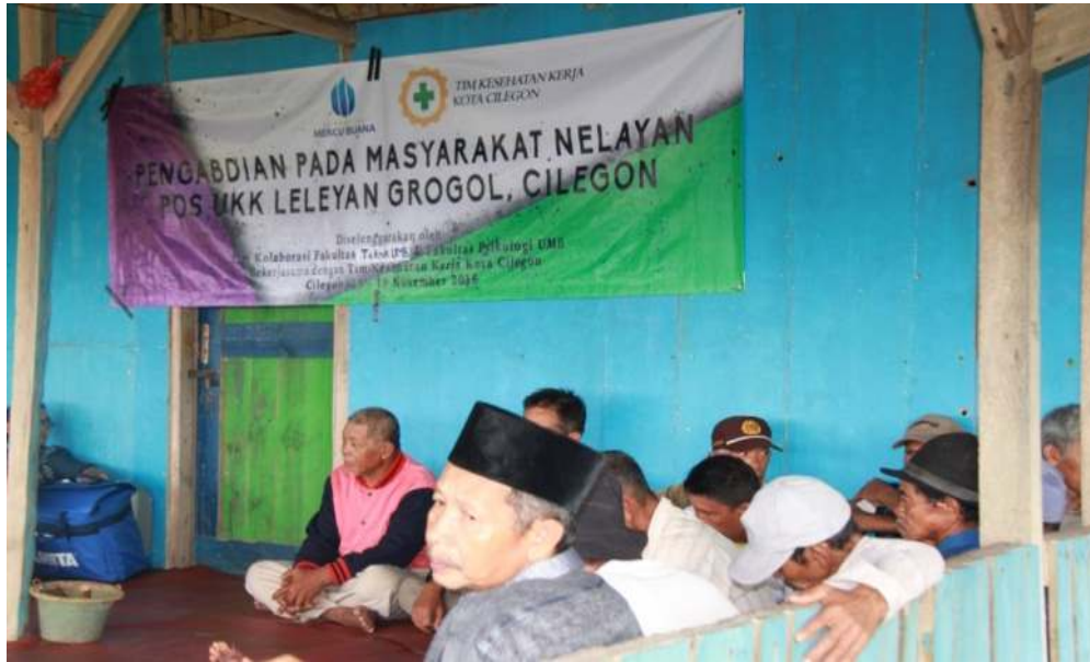
Figure 4. Implementation of Counseling