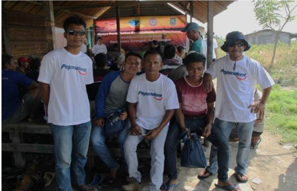
Figure 6. Distribution of Black Eyed Glasses on Fishermen