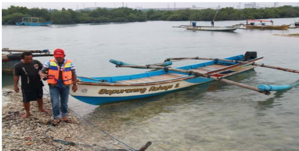
Figure 5. The use of live vest on the sea

After the advisory and counseling activities, the research team visited the location of the target audience and provided the fishing equipment needed by fishermen such as gloves and gloves as well as jackets for the needs of the sea and also the fishermen have started using the buoy as shown in the picture.