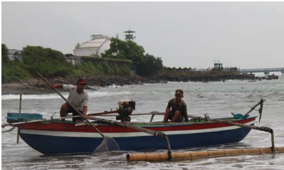
Figure 1. Target Audience Environments

From the picture it can be seen that the target audience environment has multinational industries that should be able to pay attention to the fishermen.